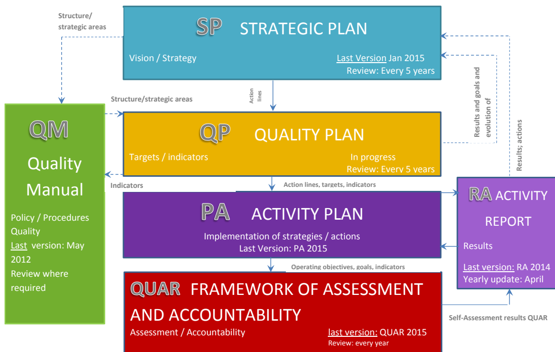
Figure 2 – Strategic management documents of Técnico Lisboa

Thus, Técnico Lisboa’s quality strategy relies on an institutional development programme with formally established milestones in strategic management documents, including actions to be carried out, monitoring fundamentals, time scales and the responsibilities and competences of the different bodies, services and agents involved.